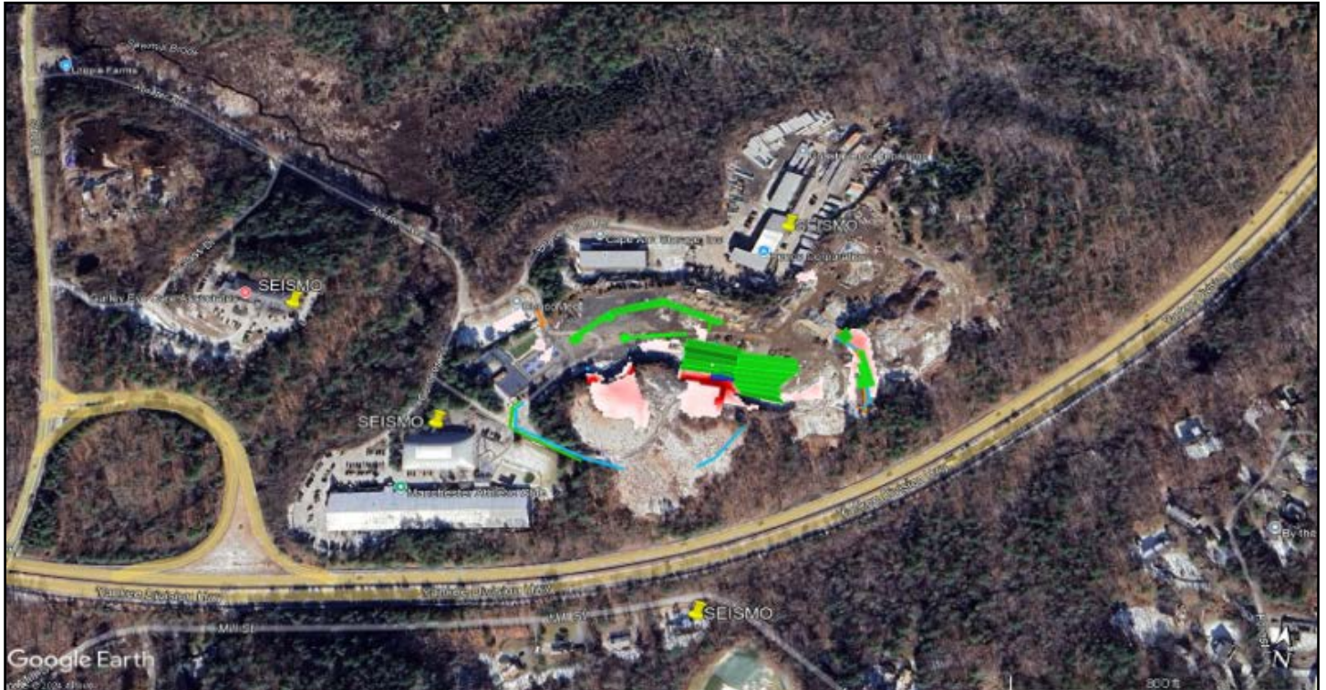
Seismograph Monitoring Plan (Not to Scale):

No. of Crew Members 3 Crew Members Names : DAVID S PEYTON M BRUCE D N/A N/A N/A N/A N/A N/A N/A N/A N/A