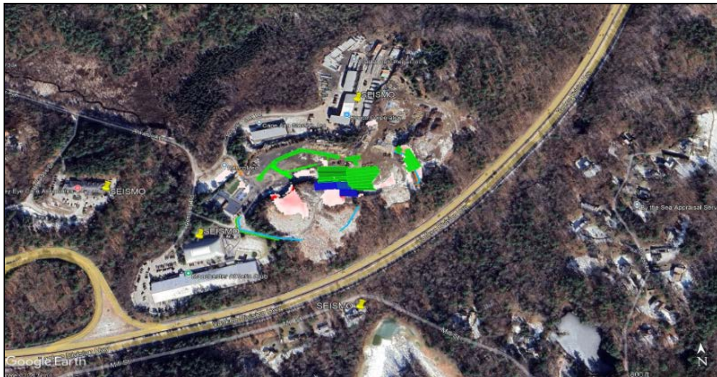
Seismograph Monitoring Plan (Not to Scale):

No. of Crew Members 2 Crew Members Names : DAVID S PAUL C N/A N/A N/A N/A N/A N/A N/A N/A N/A N/A