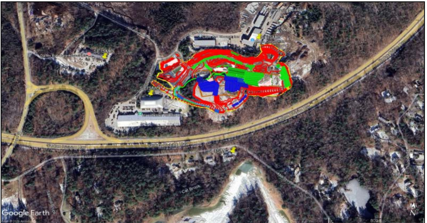
Seismograph Monitoring Plan (Not to Scale):

No. of Crew Members 2 Crew Members Names : BOBBY B SPENCER G N/A N/A N/A N/A N/A N/A N/A N/A N/A N/A